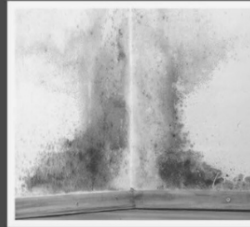
Toxic Black Mold Removal