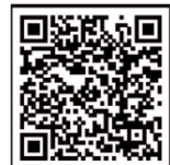
Google Play Store