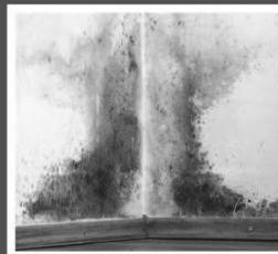
Toxic Black Mold Removal