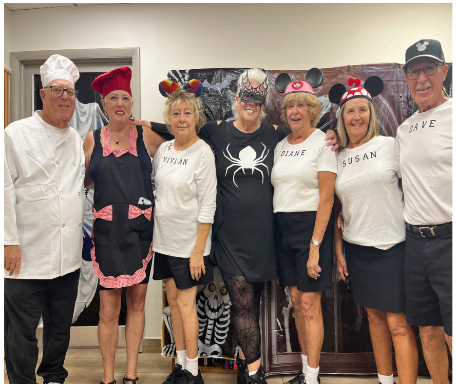
LVPOA Halloween Party 2023